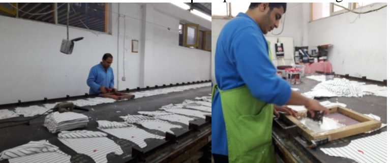
Figure (11) Natural dyes in Nature Tex

The company has 240 employees, beside approx. 60 women working from their homes. Social aspects are of highest priority and exceed the requirements of all regular certifications.