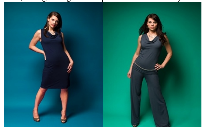
A Canadian brand, Miik made from bamboo – Figure (3)

Some marketers will rely on the fact that we immediately think it's good because it comes from a plant that carries many good properties. They stick a panda bear or bamboo shoots on the label, and that seems to be enough to convince everyone of its sustainability