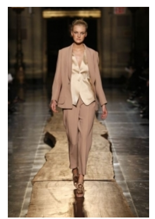
Donna Karan Figure (5) eco-fashion show