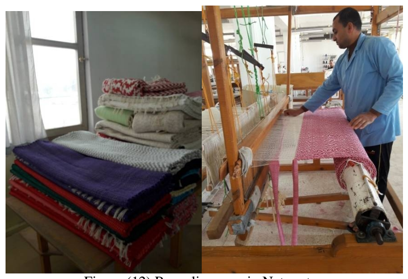
Figure (12) Recycling rugs in Nature tex