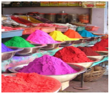
Figure (4) Eco dyes

Natural dyes are dyes primarily obtained from sources found in nature. that a great source for natural dyes can be found right in your own backyard It's not surprising—roots, nuts and flowers are just a few common ways to get many colors like yellow, orange, blue, red, green, brown and grey.