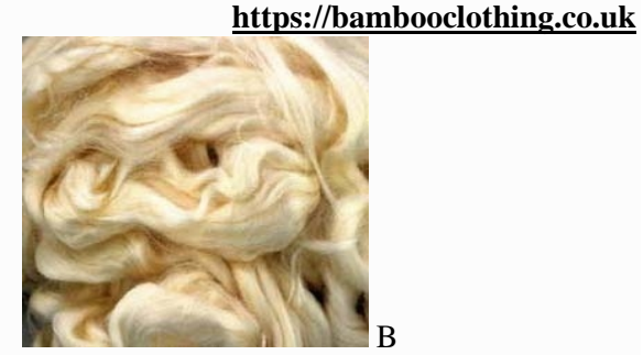
Figure (2) Bamboo plant(a) and fiber (b)

thrives naturally without using any pesticides or fertilizers, Bamboo fabric is 100% biodegradable, Bamboo only needs rain water to grow. Very little, if any, additional water is ever required, As a grass, bamboo is cut not uprooted, so is good for soil – particularly as it can grow on slopes not viable for other crops.