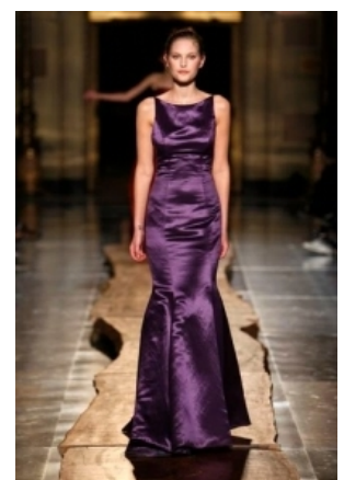
Yves Saint Laurent

Environmental Textiles Standards and Certifications strictly: