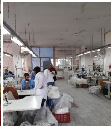
Figure (10) Nature tex factory

In 2001 a total quality management or "TQM" was established. The company was certified for manufacturing and selling Fair trade textiles by the Fair trade Labeling Organization (FLO, Max