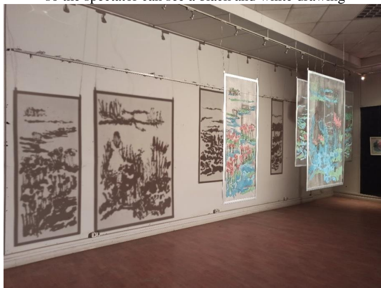
Different perspective views to the scene