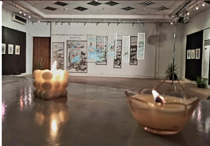
Setting a unique mood to the instillation