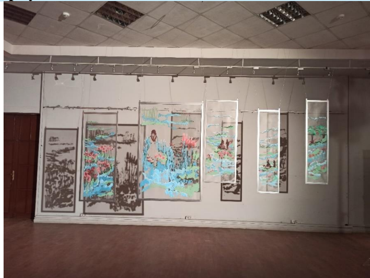
Lighting the instillation with 2 ARRI 1K Incandescent (Tungsten Halogen) Color Temperature 3200 0 Kelvin