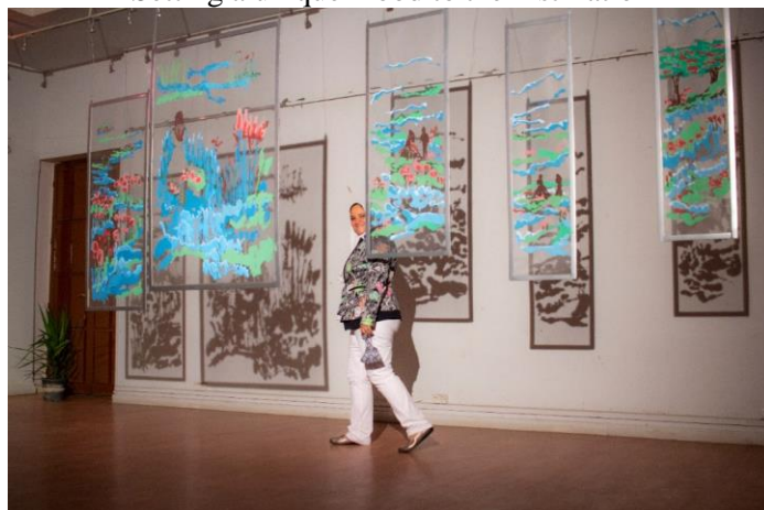
The Artist moving within her instillation parts