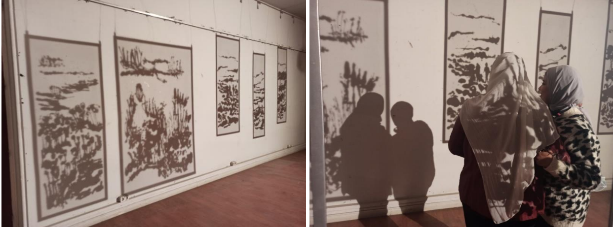
The visitors interacting with the artwork