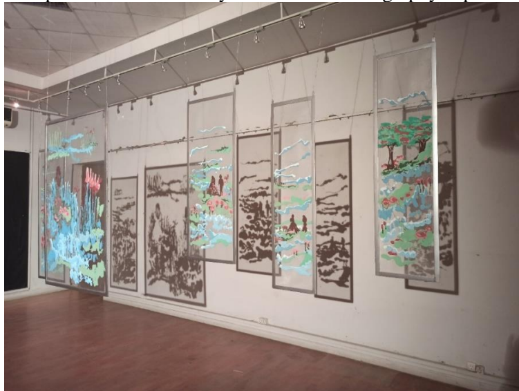
Adjusting the light to drop the shadows on the background so the spectator can see a black and white drawing