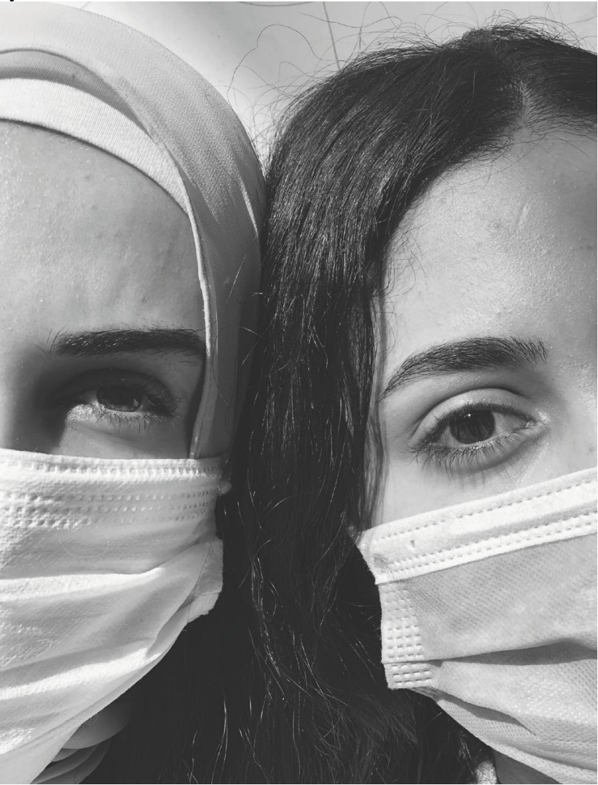
Figure 2: Two Masks