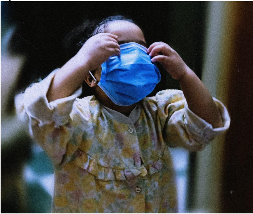
Figure 5: Kid with a Mask

Overall, the image uses a mix of direct visual cues (like the mask) and more abstract techniques (like the tear and framing) to create a layered, emotionally resonant piece that invites viewers to reflect on themes of division, disruption, and the complex emotional landscape of recent times.