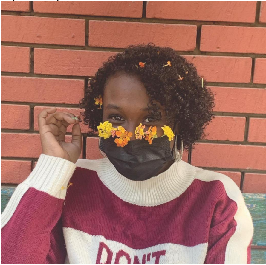
Figure 1: Girl with a Flower Mask

Case Study No. 1 by Student Aya Alaaeldien: