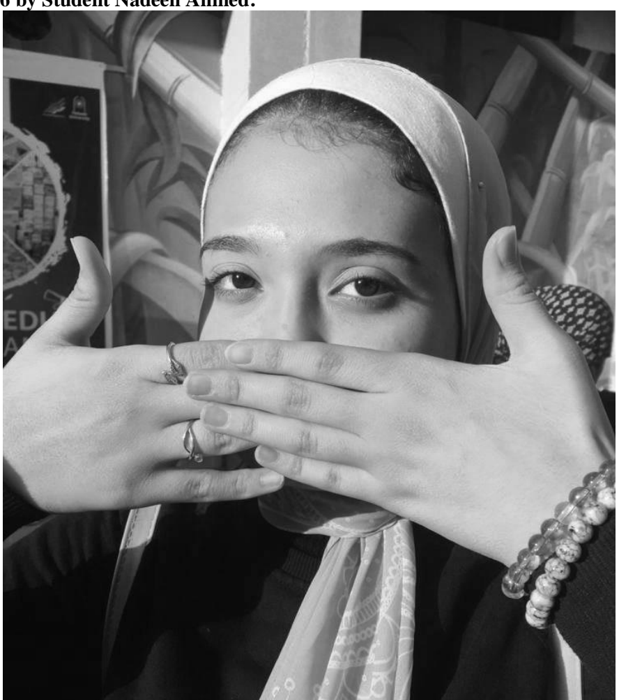
Figure 6: The Hidden Mask

Overall, the image is both a document of our times and a tender exploration of how even the youngest among us are navigating these unprecedented circumstances. The simplicity of the composition belies the depth of emotion and meaning conveyed through the child's simple, yet profound, action.