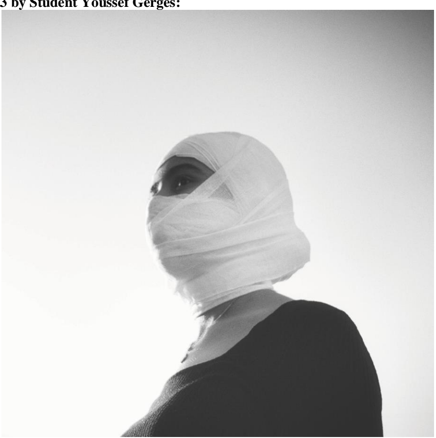
Figure 3: The Bandage Mask

In summary, this image uses composition, contrast, and symbolism to explore themes of connection, resilience, and the dualities of the human experience during a time of global crisis. Its artistic strength lies in its simplicity and the depth of emotion it conveys through minimal means.