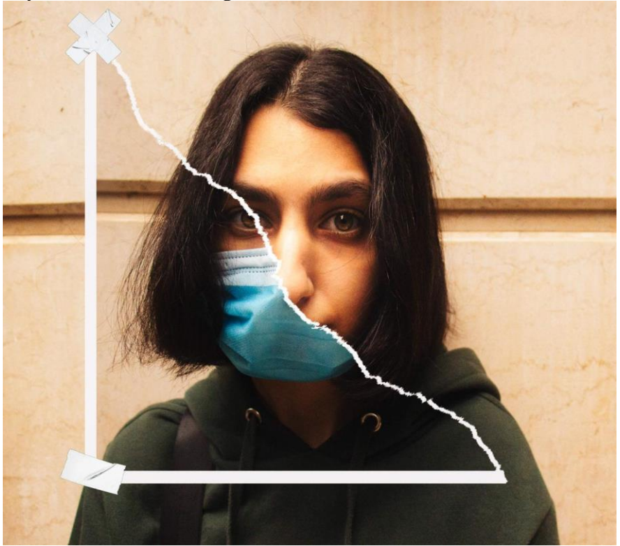
Figure 4: The Torn Mask

In summary, this image is a compelling piece of visual art that uses minimalism, contrast, and symbolism to explore complex themes of identity, transformation, and the human experience. The combination of abstract form and emotional depth makes it a thought-provoking and evocative work.