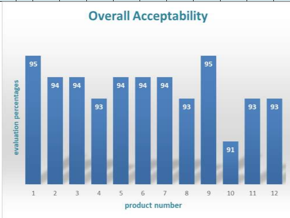
Fig. (2) the acceptability chart.