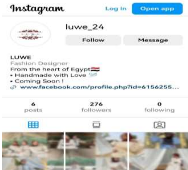
Fig. (3) the brand in the Instagram