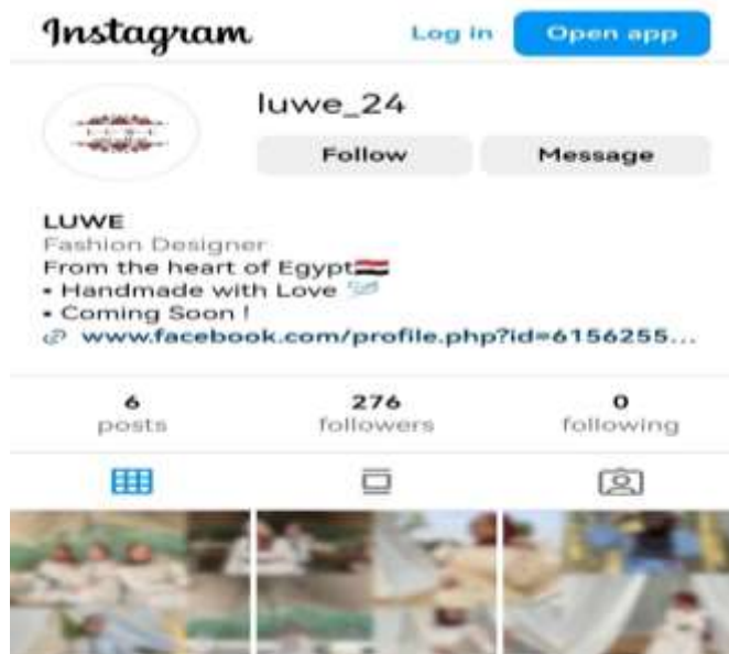
Fig. (3) the brand in the Instagram