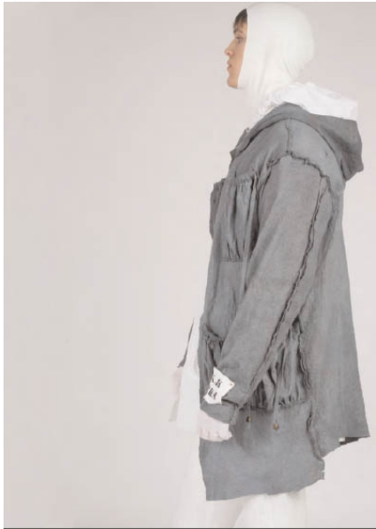
Figure 4. Shabby/Sleek: One Garment Two Styles

essential role in the reinvention process. The performance provided by the thermal comfort enabled the assembly of a garment with properties that cannot readily be achieved using more conventional fabrics. Thanks to the fabrics ability to keep the wearer cool when in warm environments and warm when in cool environments (thermal buffering) the parka has a more progressive look and feel; the fabric acts as the wearer's personal climate control system, Fig. 4. (Backhouse & Webster, 2008)