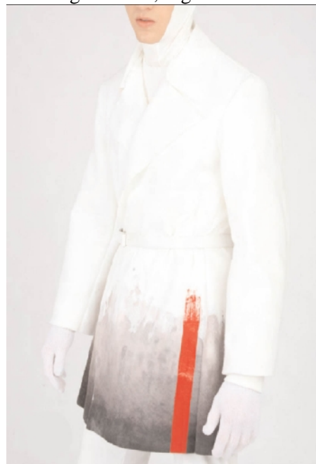
Figure 3. The Re-invention of the Trench Coat – A Future in Nonwovens

properties whilst remaining moisture vapor breathable and the polyolefin composition ensures hydrophobicity and a low pack-weight. In order to ensure that the garment maintains its clean and classic look the fabric itself provides the main design feature, Fig. 3.