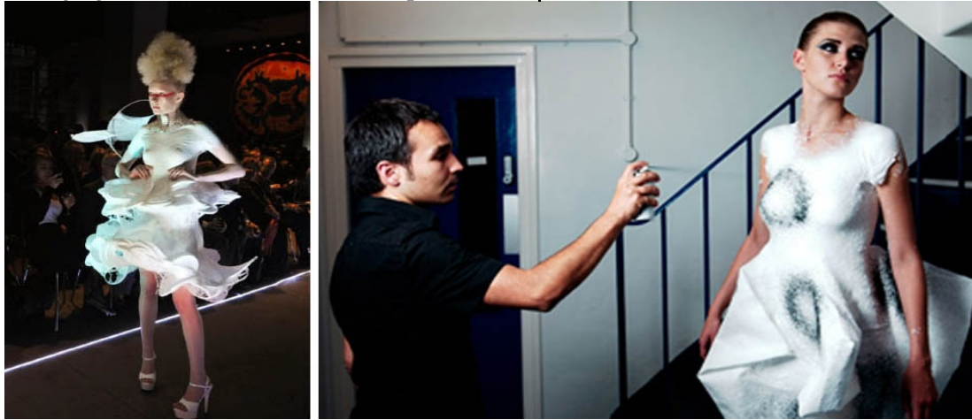
Figure 6. Spray- on dress

ten years working on his invention, to create cheap & personalized dresses. He has also unveiled a collection of haute couture made entirely out of spray-on fabric showcased at the 'science in style' fashion show in 2010, Fig. 6. (Dhange, Webster & Govekar, 2012)