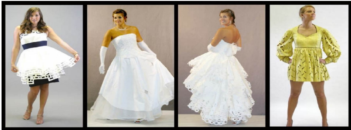
Figure 1. Nonwoven creativity of NCSU students

composition so Colbeck's® unique thermally bonded spunlaid nonwoven, made from bi-component filament with a polyester core and a polyamide skin proved ideal using the re-engineered pattern blocks. Here the 'transparency' of the nonwoven was exploited to create a mood with many facets, from soft dressing and feminine ruffles through to tailored-inspired looks, Fig. 2. (Dhange, Webster & Govekar, 2012)