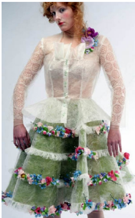
Figure 2. Example of sonic bonding, ruffles and layering