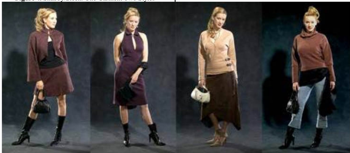
Figure 5. Examples of garments constructed out of nonwoven wool and rich wool fabrics by Canesis Network Ltd

For the last three years the nonwoven team at Canesis has concentrated on developing lightweight apparel fabrics with greater stretch and recovery. Researchers have recently designed a special collection of beautiful 100% wool and wool rich nonwoven fabrics. Fabrics with special finishes in classic coloration were used to produce a collection of very hip, yet elegant garments, Fig. 5. Some fabrics undergo additional processes to create a three dimensional patterning effect. (Anderson, 2005).