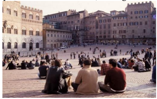
Figure 3 Social gathering in Piazza Del Camp.

Heritage plazas provide useful links to our past and have an important role to play in the future of our cities, towns, and rural environments, through their cultural, social, historical, political, economic, and physical contexts. It is considered the best way to ensure the continued role of a heritage areas in the community is to use it. Moreover, heritage areas