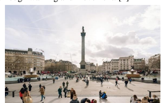
Figure 4 Trafalgar Square, London [15]

The plazas, with their different designs, allow a different type of communication between individuals, so communication is freer and different from communication in other places. It allows individuals and social groups to feel a sense of belonging to the larger entity, enjoy access to the public area, and participate in collective affairs. [8] The rules of communication in public spaces are more flexible than in other places because they allow unexpected communication and meetings through walking and movement. [2]