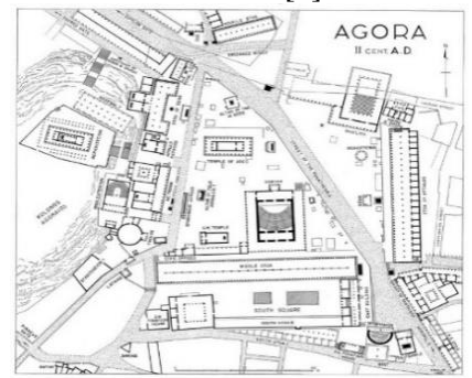
Figure 2 the master plan of Agora [14] can have a huge impact on the quality and experience of our built environment and the well-being of our communities. [3]