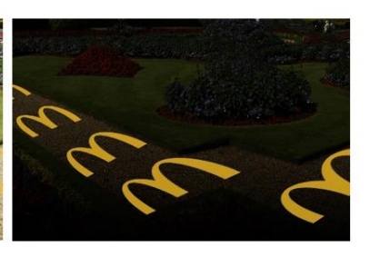
7-1-6- The sixth advertising model:

A hypothetical application of the "Pepsi" brand with luminous concrete technology in a garden