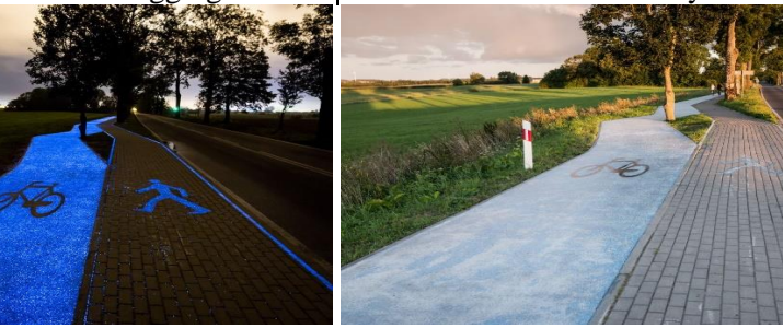
Figure (4) The effective glow is thanks to a special "ingredient".

• Spaces are more clearly defined, making it easier for users to find their way in the dark.