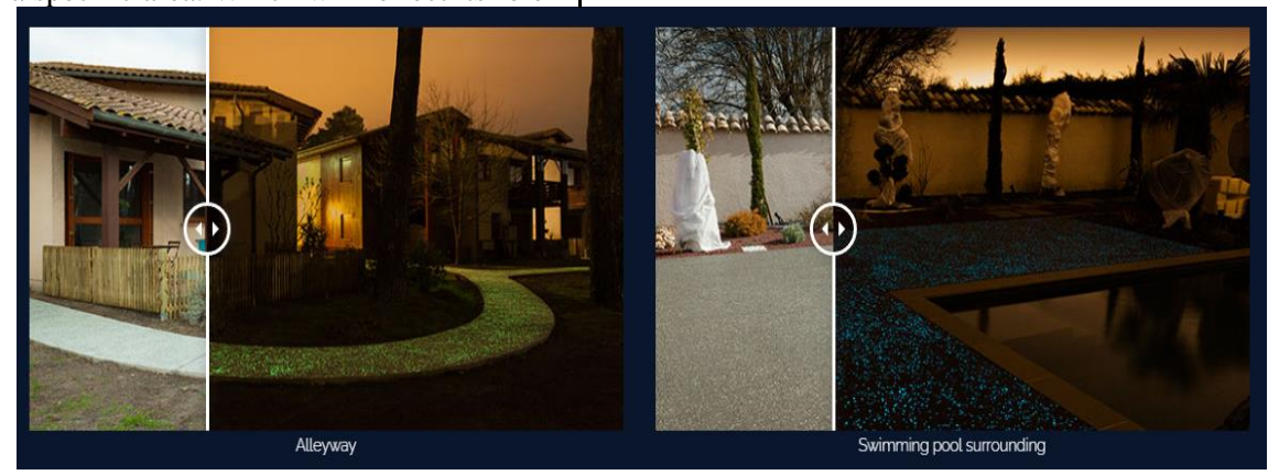
Figure (2) Although it is manufactured like ordinary cement, the change in the microscopic structure needed to make it glow modifies the structural properties of the material - thus it may not have the same applications as the ordinary kind, and is intended to be used on surfaces as a coating material.

Aggregates are any solid material incorporated in a concrete mix. As well as glow stones, concrete can include sand, gravel, pebbles and other crushed stone.