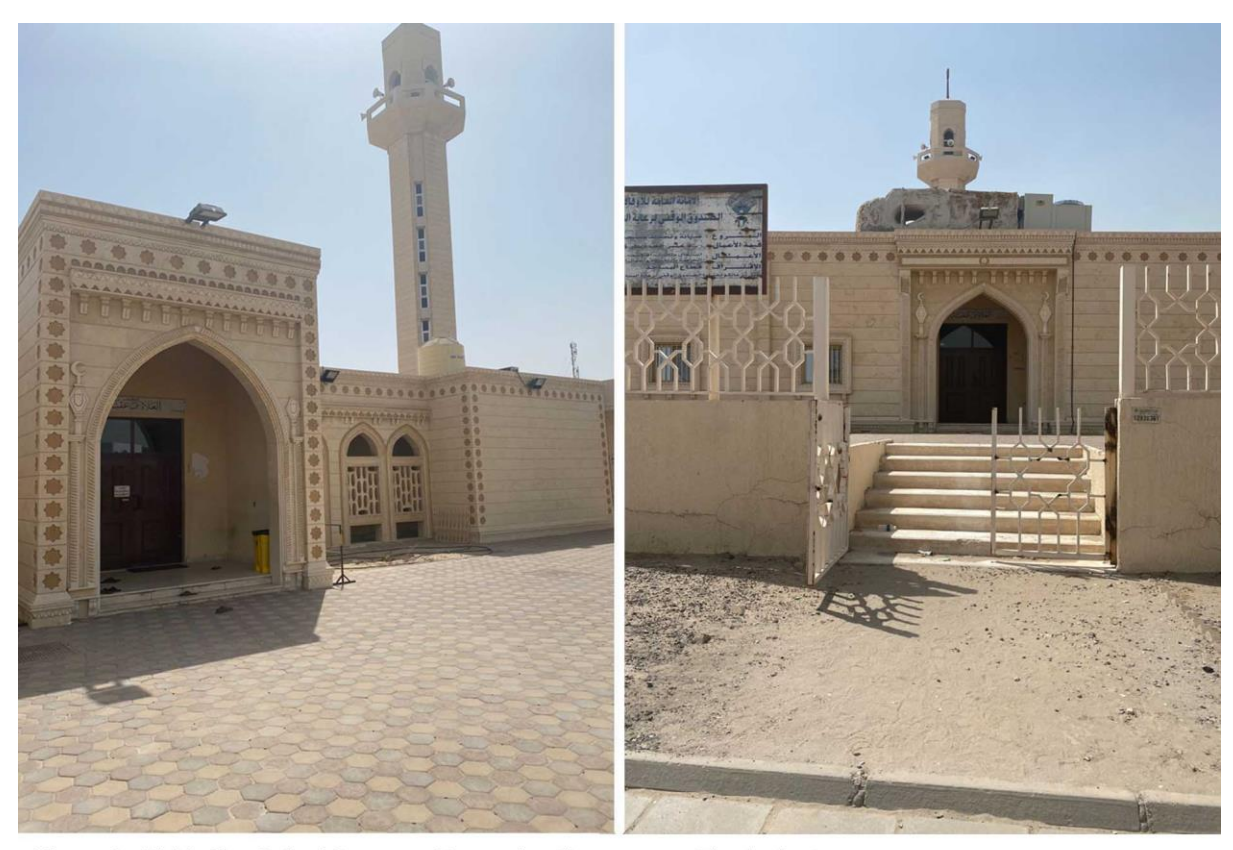
Figure 3. Al Ala Ibn Oqba Mosque at Farwaniya Governorate.