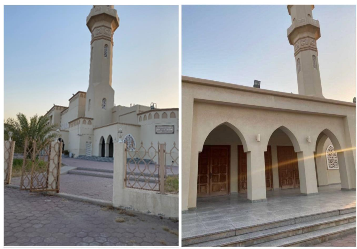
Figure 5. Douig Al Salman Al Sabah Mosque at Ahmadi Governorate.