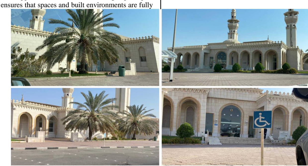
Figure 1. Al Rashid Mosque at the capital Governorates(the Author).

There is mostly a central mosque in each neighborhood in Kuwaiti and primarily located within the main public utility center that the government provides in each governorate. The author selected one main mosque from each of the six governorates of Kuwait, as these main mosques are the most used for daily prayers, plus the Friday congregational prayers. In doing so, the author sought to show a representative sample on the condition of mosque design in Kuwait.