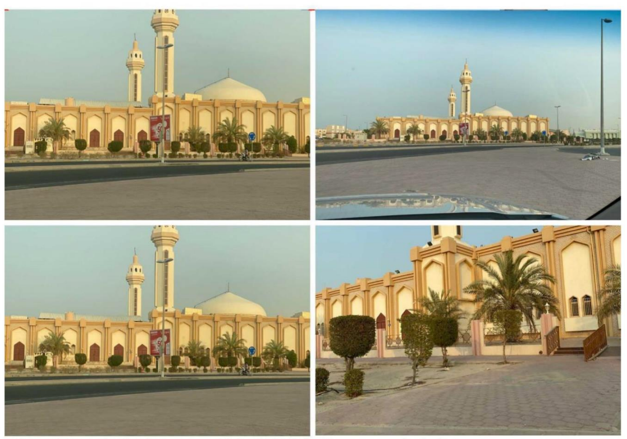
Figure 6. Omar Ibn Omair mosque at Mubarak Al-Kabir Governorate (the Author).