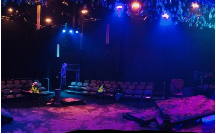
Figure (2)

In the production of "dark water" the lightning designer put in efforts to reduce the use of electricity and resources by using new technology and efficient lighting system. They replaced the old bulbs with less consuming led bulbs with consumed a lot less power than the previous high voltage bulbs. (Walters in Rowan, 2015, p. 99)