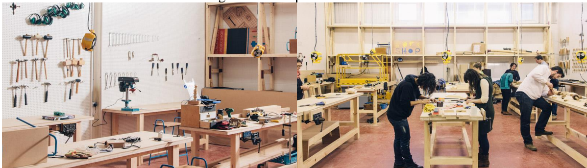
Fig. (23) (24) The interior architecture of workshops spaces in the vocational centers, which represent the spaces of creativity, innovation, production and the main space in the vocational training centers by different activities and fields [6].

As construction costs and labor demand increase, these types of learning spaces can also help educational districts for saving initial construction costs, annual operating and maintenance budgets. Promoting entrepreneurship-based innovation is central to today's successful collaborative learning environment, as well as, these standards must be designed in spaces to encourage imagination. It is a place to learn, design, collaborate without rules and explore new inventions and innovations (Figure 23,24).