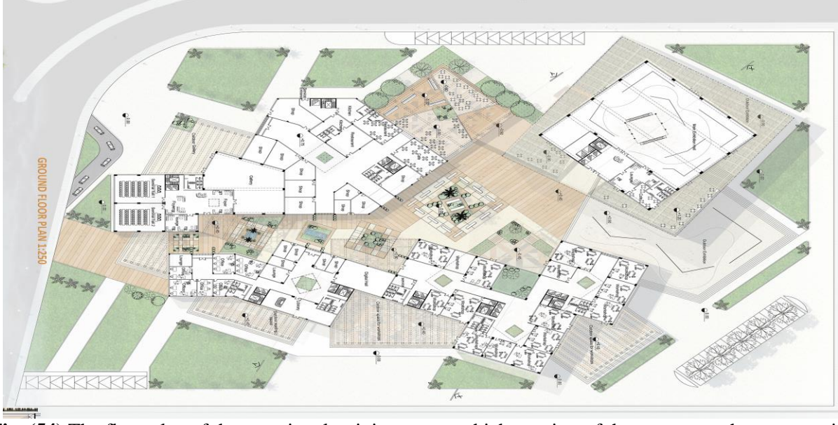
Fig. (54) The floor plan of the vocational training center which consists of the entrances, the commercial area, the main courtyard of the project, workshops and the main hall.

Citation: Ola Ahmed (2022) Vocational Training Centers and Their Development Through Contemporary Design Trends, International Design Journal, Vol. 12 No. 1, (January 2022) pp 367-380