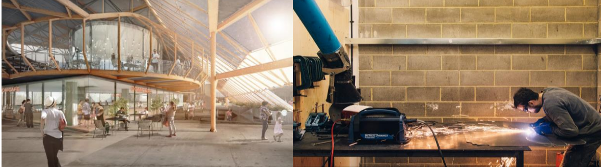
Fig. (18) (19) Interior architecture of a vocational center design shows open spaces with services, corridors, spaces of educational workshops, galleries and administrative spaces [3].

studio or workshop includes the intellectual and practical aspects. The working environment must have specific design criteria, as it functions as a place of production. Creative spaces can be luxurious, fun, structural, bright, colorful, organized, elegant, or otherwise designed to stimulate participants to creativity and production [2].