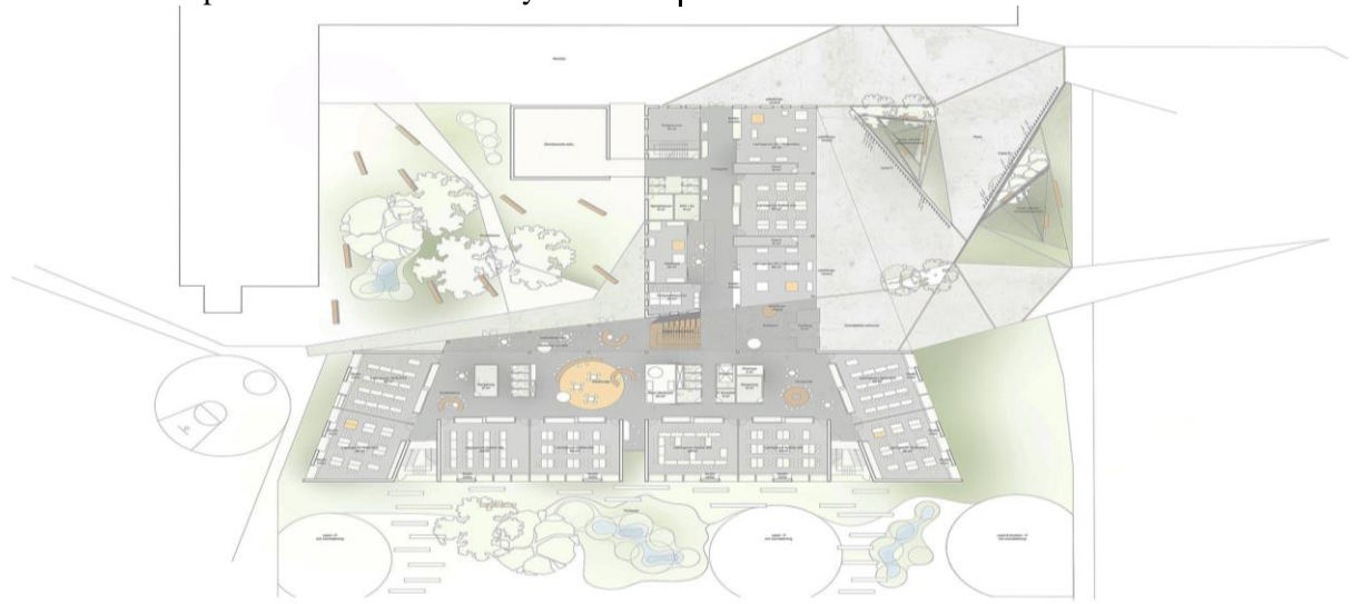
Fig. (39) the vocational training center floor plan which shows the interior spaces, corridors and services.

elements such as composition, function, interior space and architectural design. In the framework of digital architecture, vocational training centers have been affected by the digital revolution to become the space flexible (Figure 39,40,41).