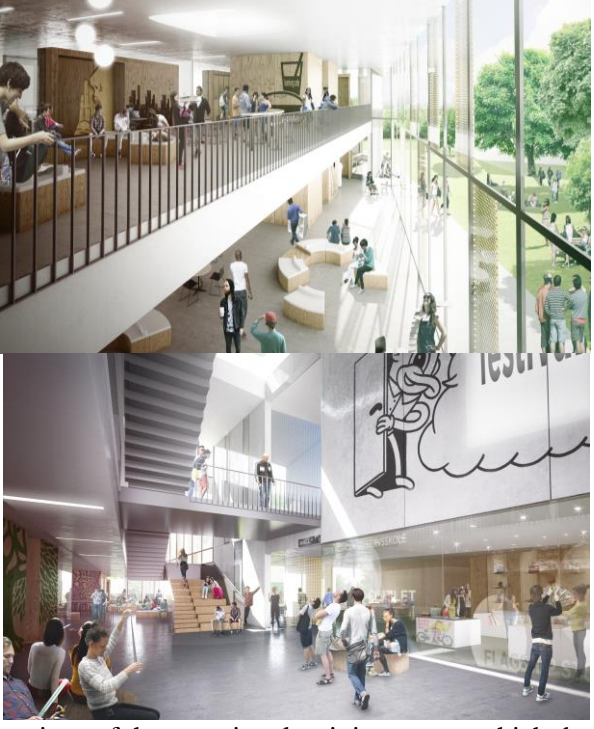
Fig. (40) (41) Interior perspectives of the vocational training center which demonstrates the impact of the digital age and flexible open spaces with double focus on providing ideal learning spaces, as well as, providing learning spaces in the three exterior areas determined by the size of the building. Inside, learning spaces are designed around a flexible "shared space", with direct access to each element. The union space provided the possibility of maintaining a variety of functions, from a coffee shop in the most open, to the spaces of workshops in the double height areas, to the quiet study areas [14].