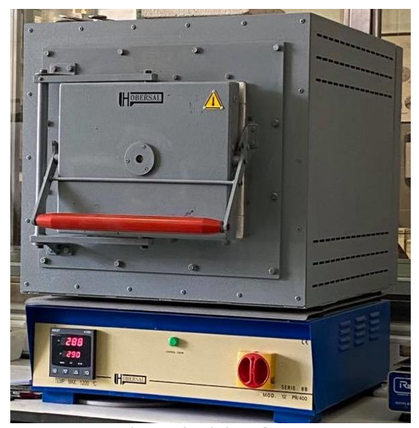
Figure 3 Digital Oven

These two molds with the braided performs inside have been placed in a digital oven (figure 3) after reaching the melting temperature of the used thermoplastic for almost 40 minutes ( \pm 5 min) in order to obtain the final shape of the post. Then, after the mold has been cooled, the posts were removed out of the mold using a very thin needle. The fabrication method used for producing the novel posts understudy is represented in the next flowchart (figure 4) to illustrate the main processes in the whole manufacturing process.