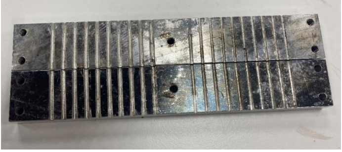
Figure 2 Aluminum Mold

two different diameters (1.5 - 2 mm) 10 grooves per each diameter (figure 2). Two similar molds were used throughout the melting process to accelerate the production process.