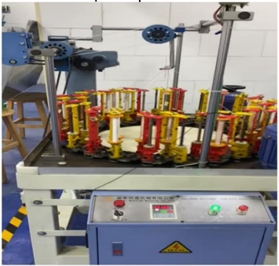
Figure 1 Braiding machine

after clarifying an initial and basic parameter of the whole braiding process.