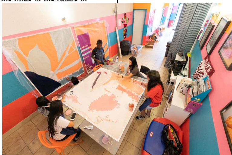
Figure 7 Artist Layqa Nuna Yawar works with Art Education students at the Southeast by Southeast hub space in South Philadelphia. (MAP, 2019)

immigration the U.S.A (ibid). The artist worked in collaboration with Art education students to produce this mural (ibid). Process photos