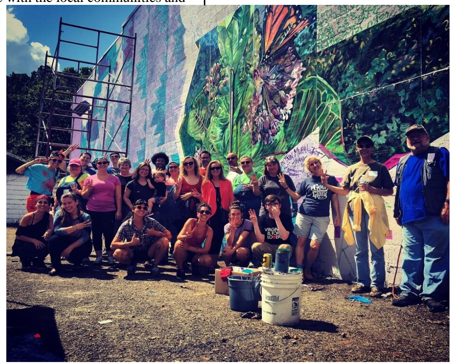
Figure 2 2018 Mural Fest participants, Harlan County Kentucky

HGHC was launched in 2001 in Kentucky, U.S.A, as a community- based art organization that encouraging locals to civically engage in art projects- particularly photography and documentary film- as a form of subtle political resistant to concerning social and cultural issues in their communities (Mullinax, 2012)