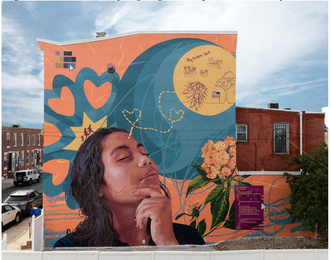
Figure 6 Migrant Imaginary © 2019 City of Philadelphia Mural Arts Program / Layqa Nuna Yawar & Ricardo Cabret, 1902 South 4th Street.

This mural is one of the most recent works of the MAP, it has been completed in October 25<sup>th</sup> 2019