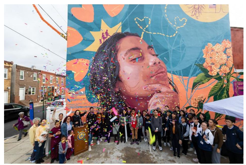
Figure 10 Migrant Imaginary dedication, October 29, 2019.

The city of Philadelphia Mural Arts Program's Journey and projects are a very inspiring example of Community-engaged Public art practices and their journey could be a road map for artists to achieve their projects around the world.