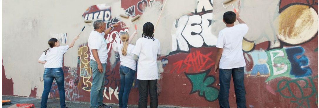
Figure 3 Philadelphia Anti-Graffiti Network (PAGN) team painting over graffiti at Broad and Spring Garden streets.