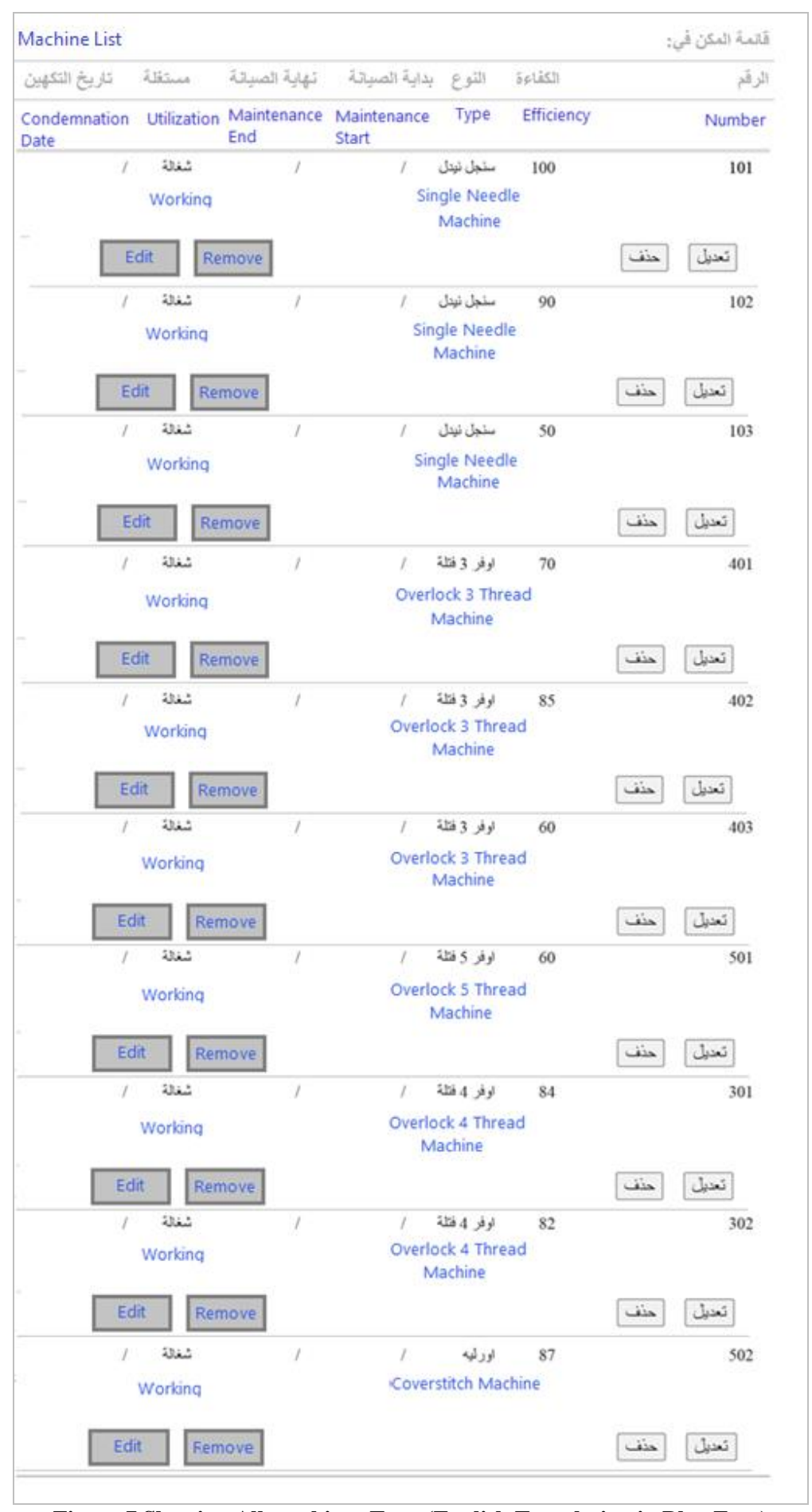
Figure 7 Showing All machines Type (English Translation in Blue Font)