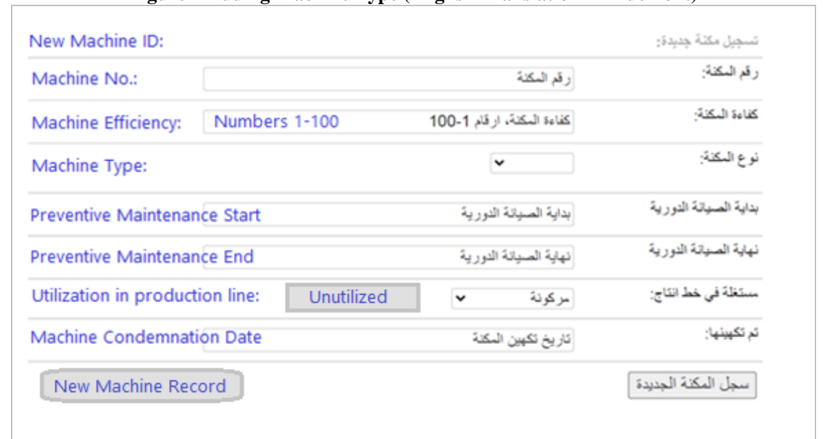
Figure 2 Adding Machine Data (English Translation in Blue Font)