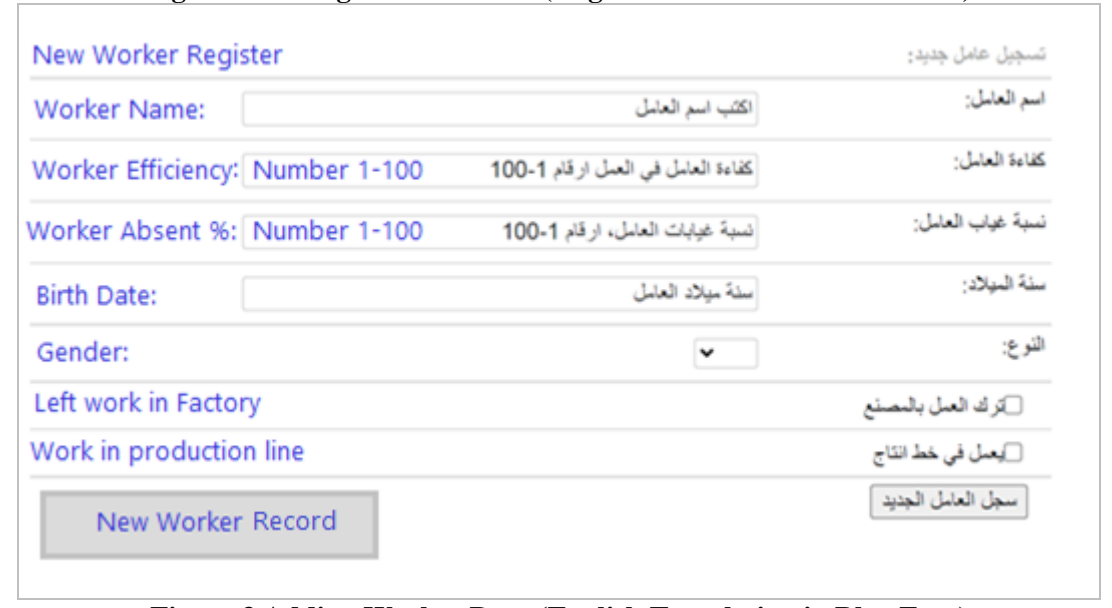
Figure 3 Adding Worker Data (English Translation in Blue Font)