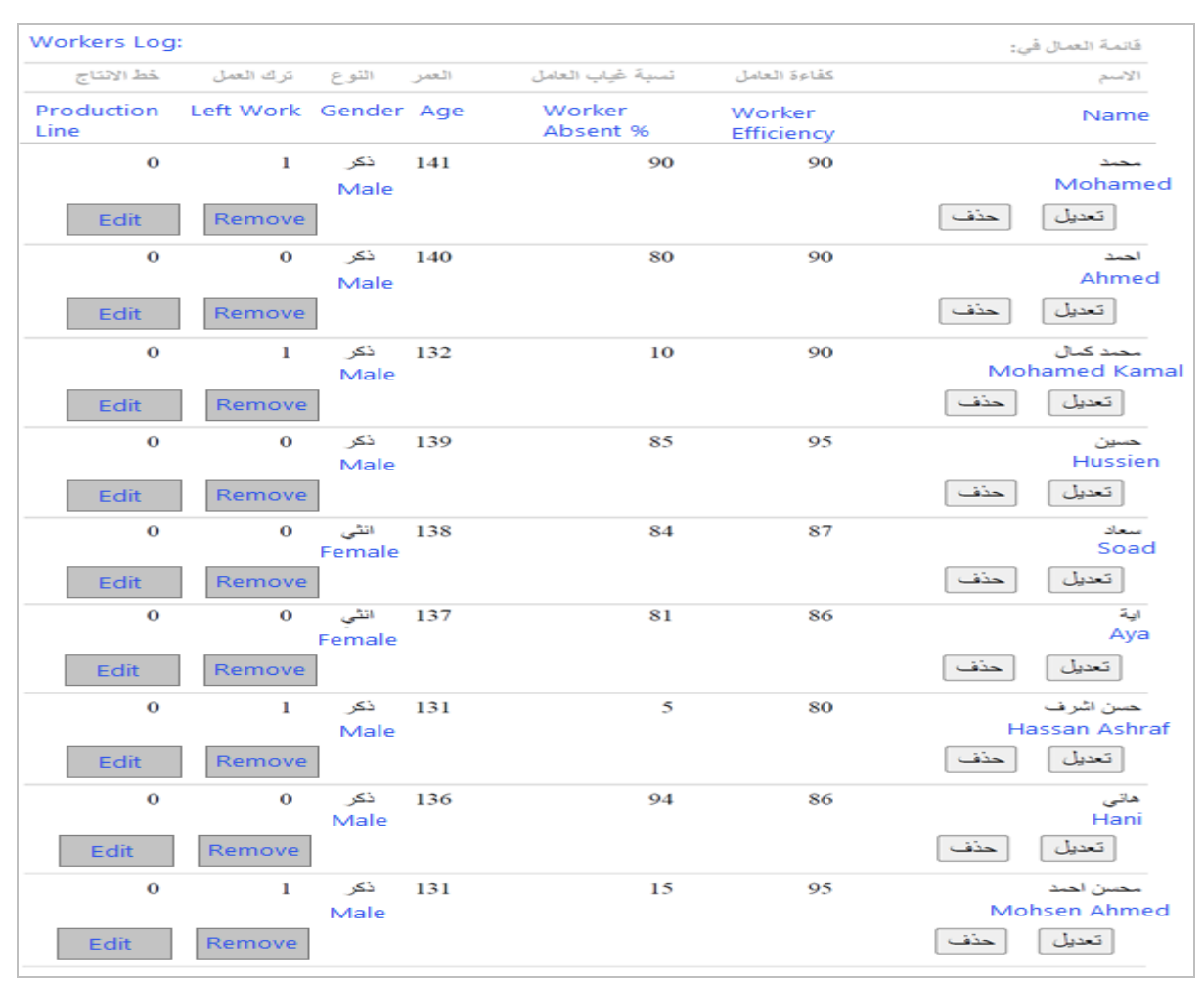
Figure 8 Showing All Workers Data (English Translation in Blue Font)