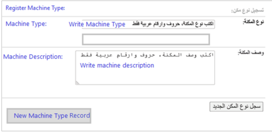
Figure 1 Adding Machine Type (English Translation in Blue Font)