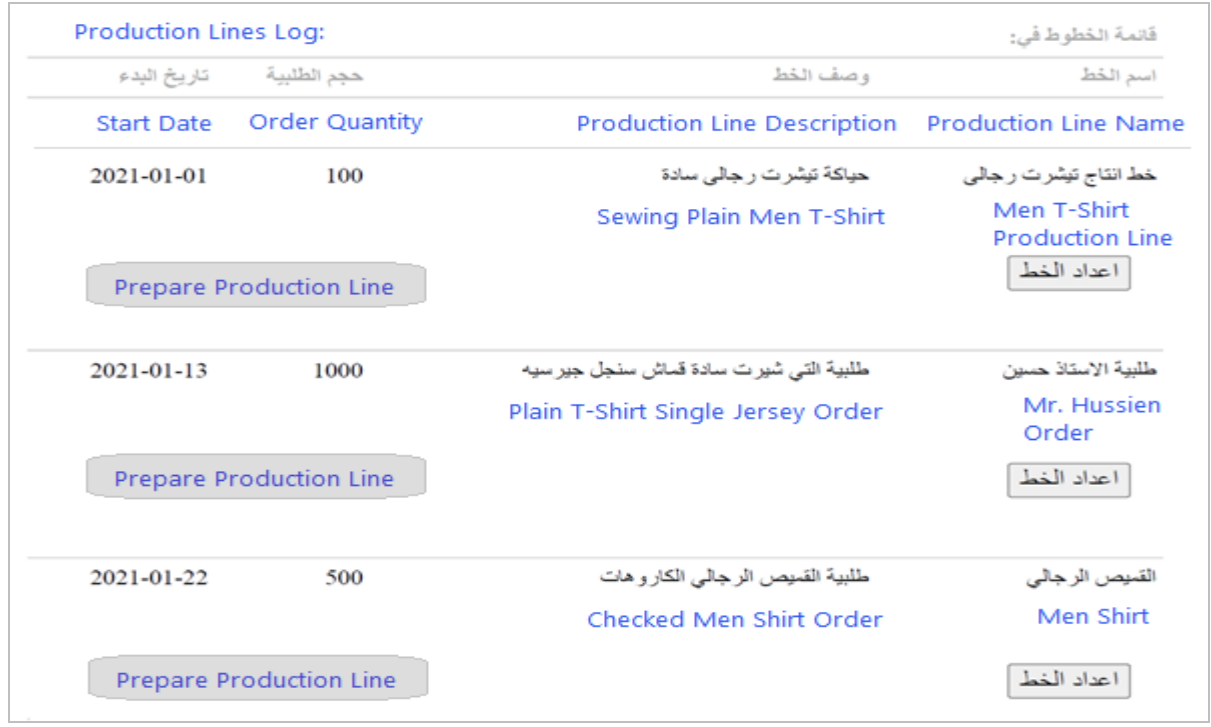
Figure 10 Showing All Production Lines Data (English Translation in Blue Font)