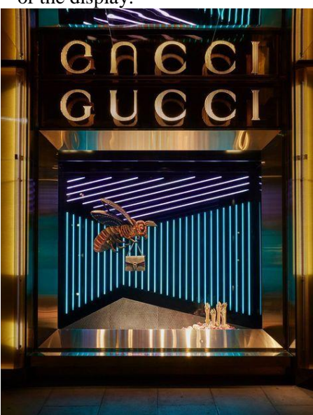
Figure 1: Examples of Closed-Back Window – Gucci Creative Windows Display https://uk.fashionnetwork.com/news/gucci-a-window-display-revolution,553358.html - (Accessed

dramatic effect can be achieved as lighting can be angled and controlled to highlight the focal point of the display.