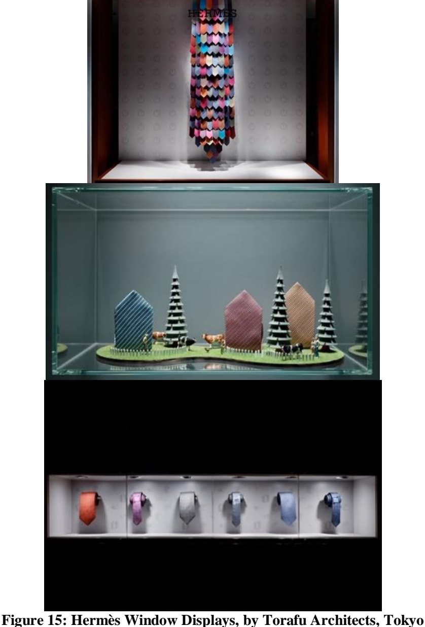
https://retaildesignblog.net/2012/12/28/hermes-window-display-by-torafu-architects-tokyo/ - (Accessed

5- <u>Hermés window display by Torafu Architects,</u> Tokyo: "Figure 15"