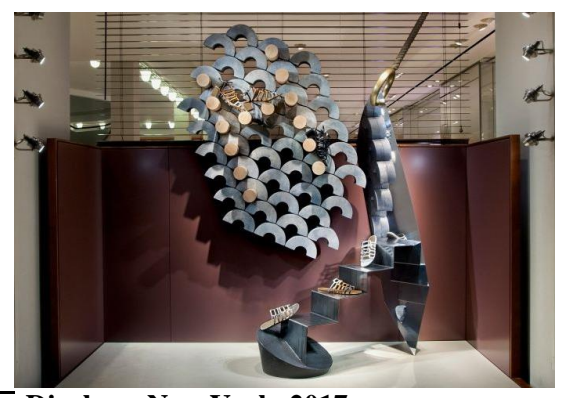
Figure 11: Hermès Window Displays, New York 2017

https://retaildesignblog.net/2017/04/01/hermes-window-displays-by-fotis-evans-new-york/ - (Accessed 12.07.2019)