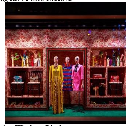
Figure 4: Examples of Realistic Setting Windows Display

It is a type of window that shows things exactly as they appear in true life. Dummies and mockups are being used instead of models. This is the most common type of window display and is often used in furniture and home furnishing shops. A realistic setting is essentially the depiction of a room, area, or otherwise recognizable locale, reinterpreted in the allotted display area, either in the windows or inside the store. The realistic setting best controlled and most effective in a fully enclosed display window. Here, the display person can do a miniature stage setting. He or she can simulate depth, dimension, use color, and light with great effect-all viewed, as planned, from the front, through a large plate-glass window. When realism is the thing, scale is of utmost importance. The display area should not be weighted down with props or elements so large that the scale of the setting shrinks by comparison. A realistic setting requires the careful blending of color, textures, shapes, and the proper lighting to keep the background at a proper distance. At certain times and in certain stores, however, a realistic setting can be most effective.