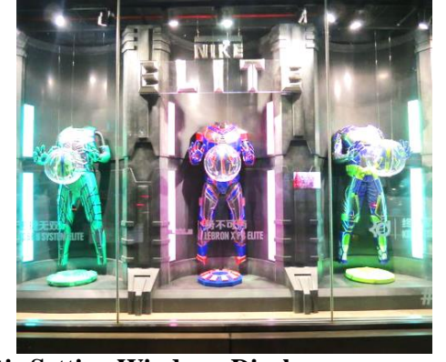
Figure 9: Examples of Futuristic Setting Windows Display

https://www.flickriver.com/photos/93779577@N00/5246861675/ - (Accessed 12.07.2019)