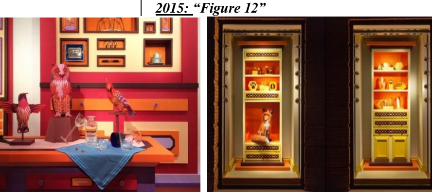
Figure 12: Hermès Window Displays, Shanghai, China, 2015

incorporated in the brand's handbags, scarves, 2-belts, and jewelry.