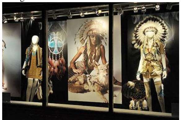
Figure 10: Examples of Nativism Setting Windows Display

community and those who love indigenous products, this type of window display also aims to contribute on the revival or perpetuation of an indigenous culture.